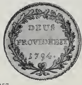
Lot No. 3357

3357 BERN. 2 Duplones, 1794. Obv. Crowned Arms. Rv. DEUS PROVIDEBIT and date within oak wreath. KM 59, Fr.168. A sharp and fully prooflike striking. Brilliant Uncirculated and choice. A splendid coin. (SEE COLOR PLATE) (1,750-2,250)